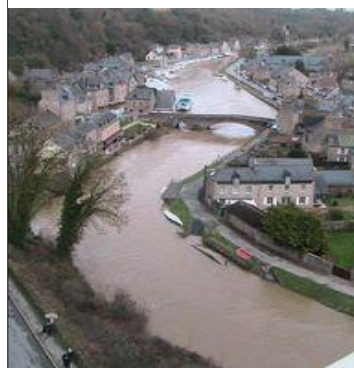
Rance in Flood - Dinan Vieux Port

No different from the UK, Brittany has suffered incredible floods, especially in the west. The Rance valley has been transformed into the "Land o'Lakes" with vast amounts of farmland under water and sand bags used extensively. We had thunderstorms in summer 2013 and our gutters have had to cope with vast amounts of rain from every angle. It only rains twice in Brittany, we're told, in January...and in the rest of the year. Great contrast to last July and August, when we roasted!